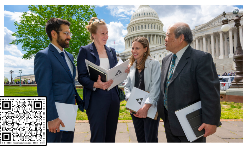
Casualty volunteers on Capitol Hill

Academy staff and volunteers distributed business cards with QR codes, which offered policymakers' staff links to key practice-area work, initiatives, and upcoming events and webinars. Staff and volunteers will continue to work with stakeholders on ongoing and new initiatives.