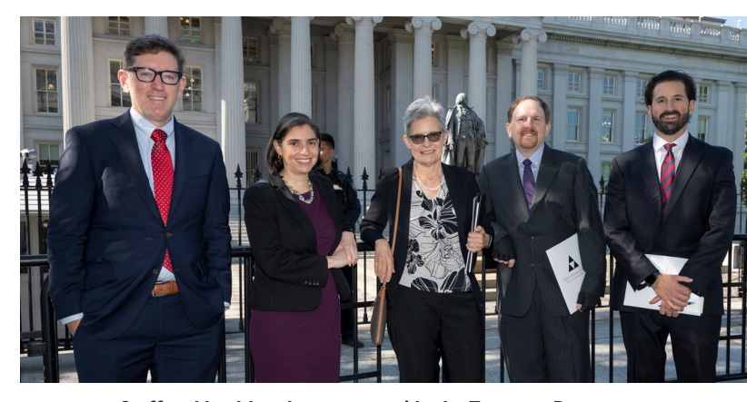
Staff and health volunteers outside the Treasury Department

Cyber volunteers' meetings included a discussion with the White House Office of the National Cyber Director. Conversations over the two days focused on the most effective cyber risk mitigation techniques, understanding data availability and limitations, and the Academy's Cyber Risk Toolkit .