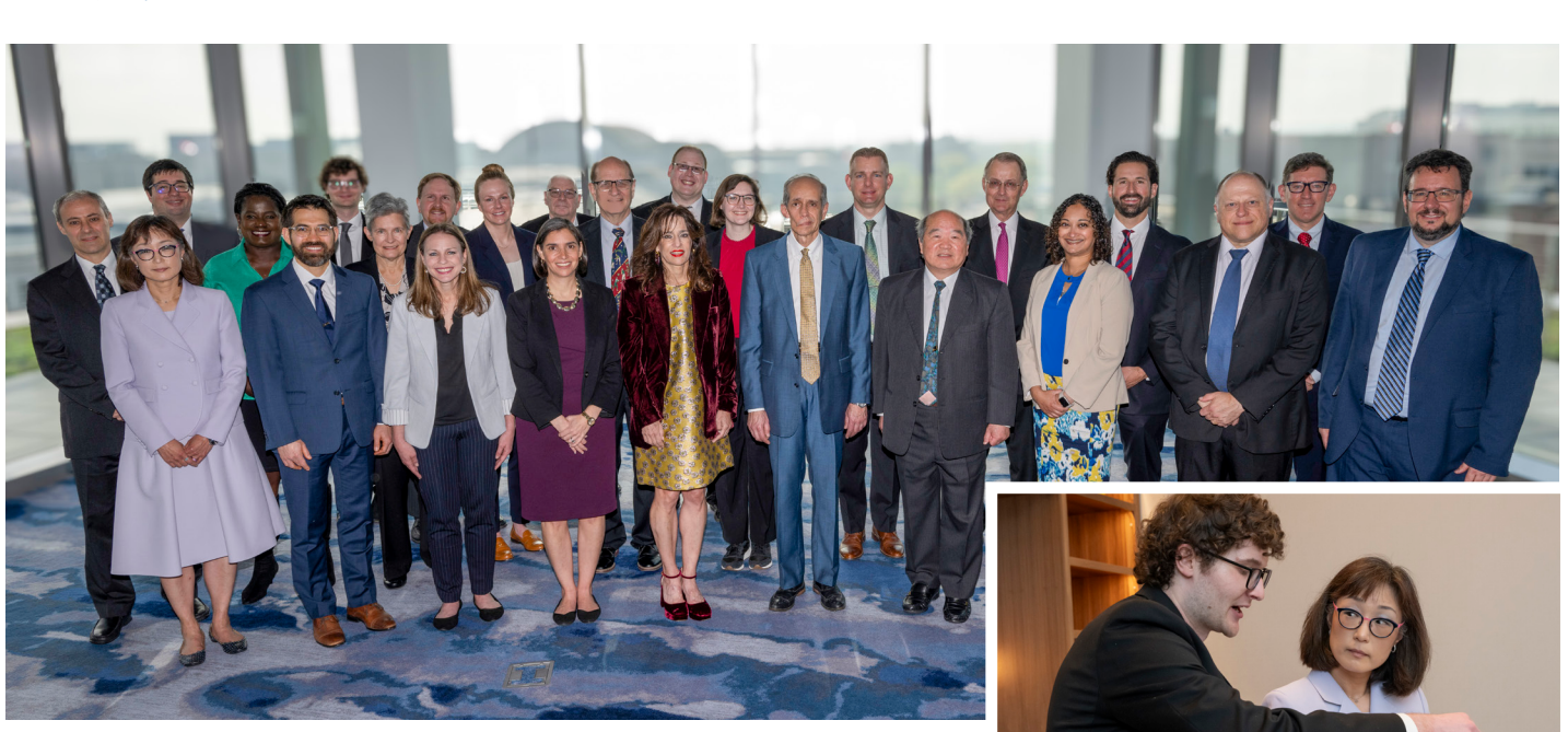
Volunteers & staff assembled for Hill visits

'Actuarially Sound' —For more, see the Academy's <u>Actuarially Sound blog</u>. ▲