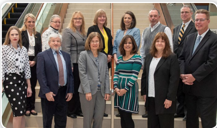
HPC volunteers and Academy staff at the March 7-8 Capitol Hill visits

Other topics of interest included efforts to address health care cost growth and Medicaid expansions in additional states (potentially adding work requirements to the program); providing reinsurance funds and increasing ACA Section 1332 flexibility; new rules on expanded availability of association health plans and short-term limited-duration plans, and the proposed rule on health reimbursement arrangements; alternatives to the individual mandate now that it has been set at zero with no penalty; and the implications of recent legislative and regulatory changes on the individual, small, and large group markets. ▲