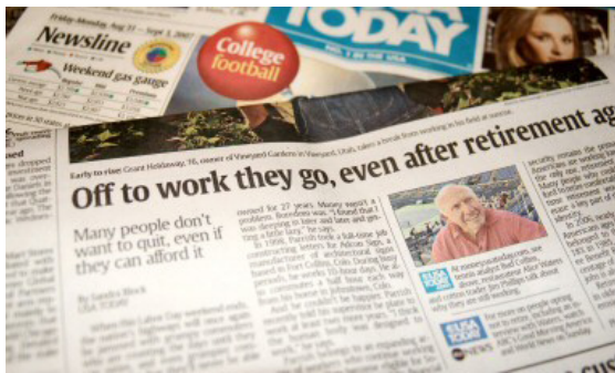
Journalists frequently turn to the Academy as a reliable source of data on life expectancy and longevity. Academy statistics were included, for example, in a USA Today feature on phased retirement.