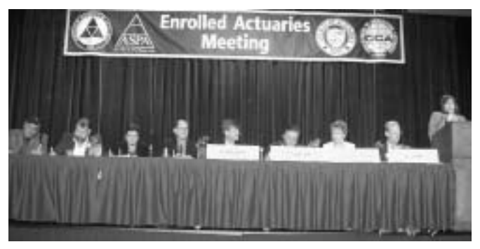
A professionalism session at the EA Meeting.

It may help your critique of the EA Meeting if you better understand the objectives for this conference. Certainly we want